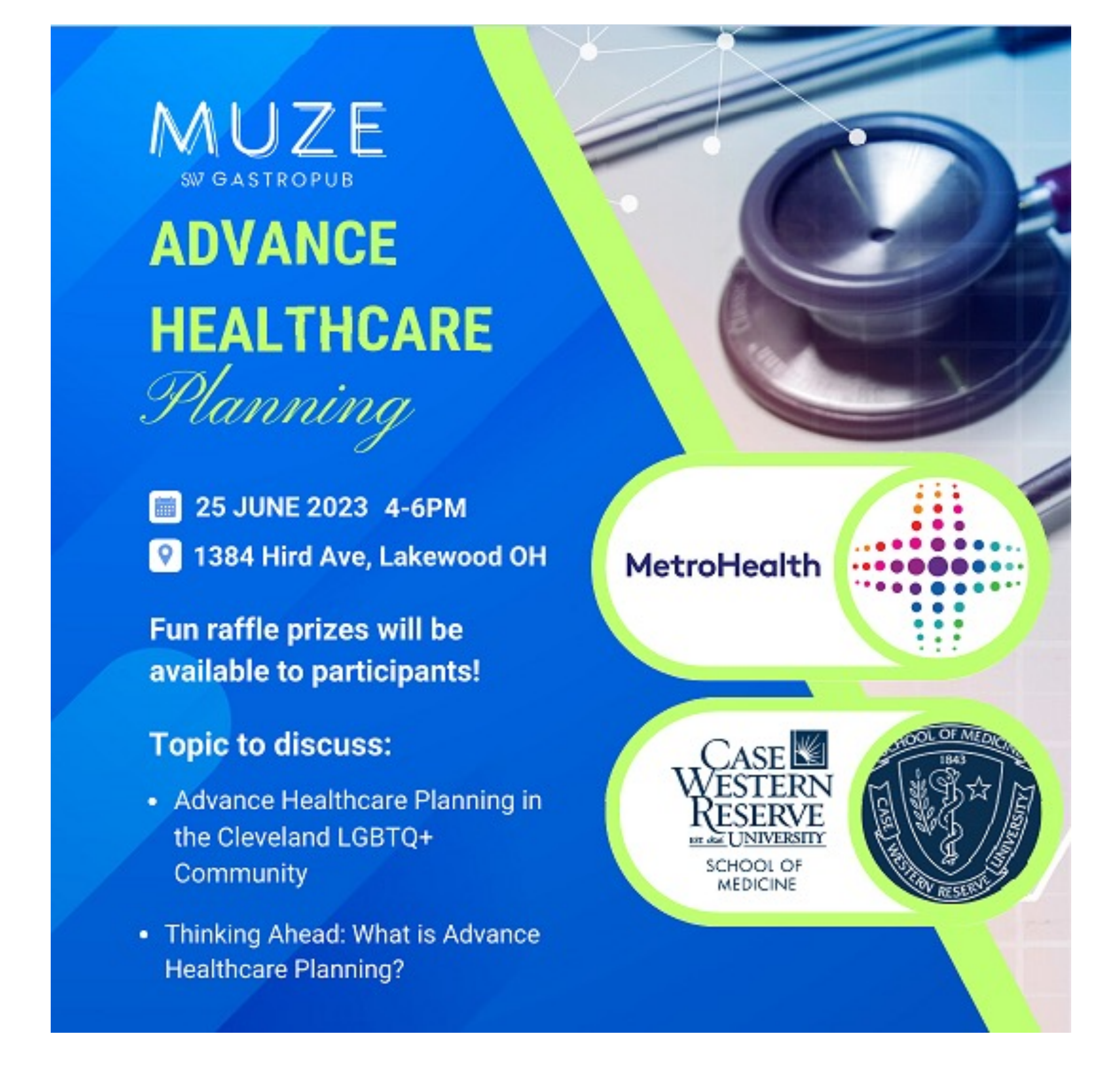
Figure 2—Flier: Promotional flier for one of the events I helped coordinate and facilitate, held on June 25, 2023 at Studio West 117 by MetroHealth and Case Western Reserve University's Inamori International Center for Ethics and Excellence.