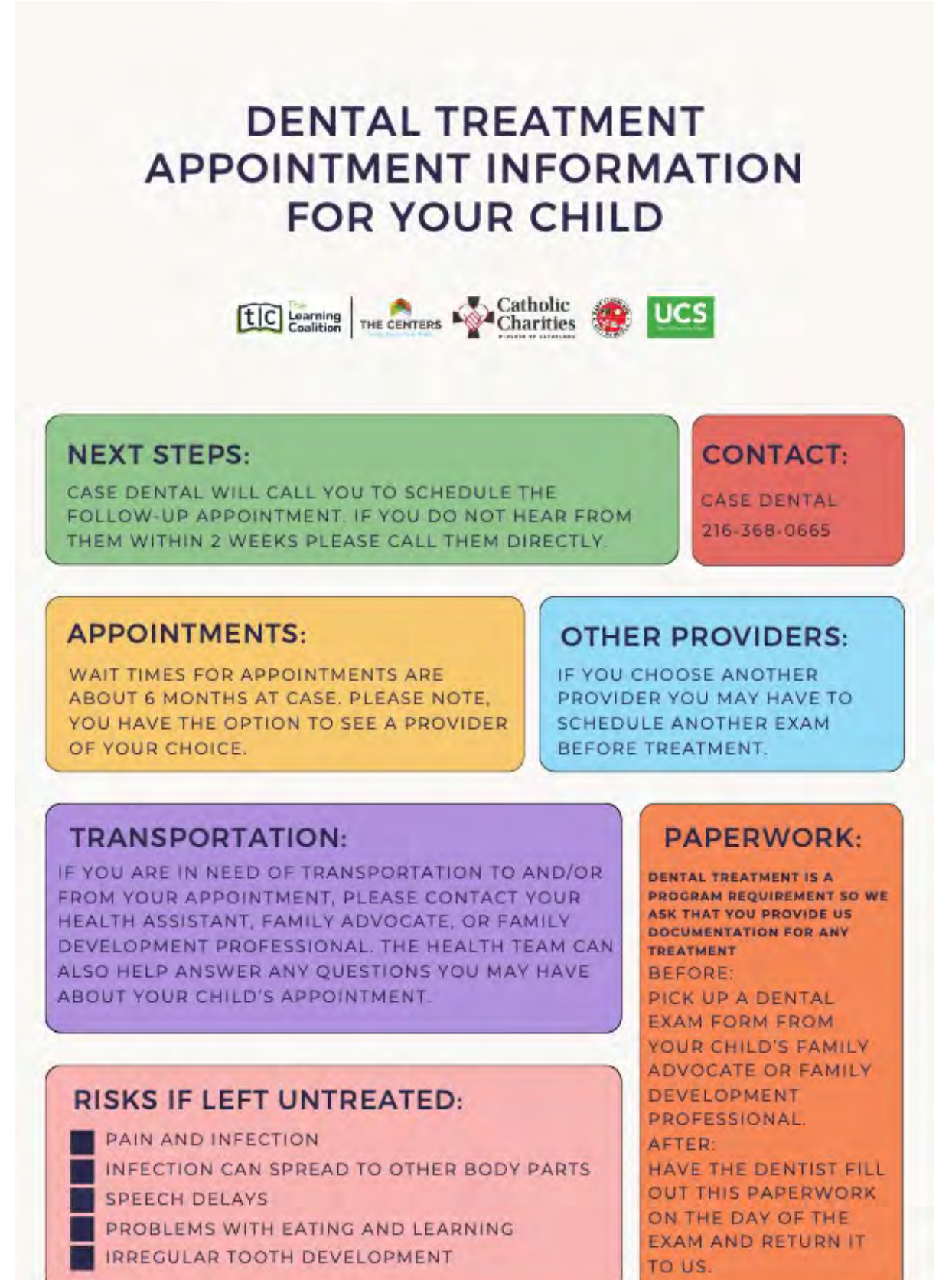
Figure 3 – Post-treatment infographic

Demonstrates the importance of preventive care