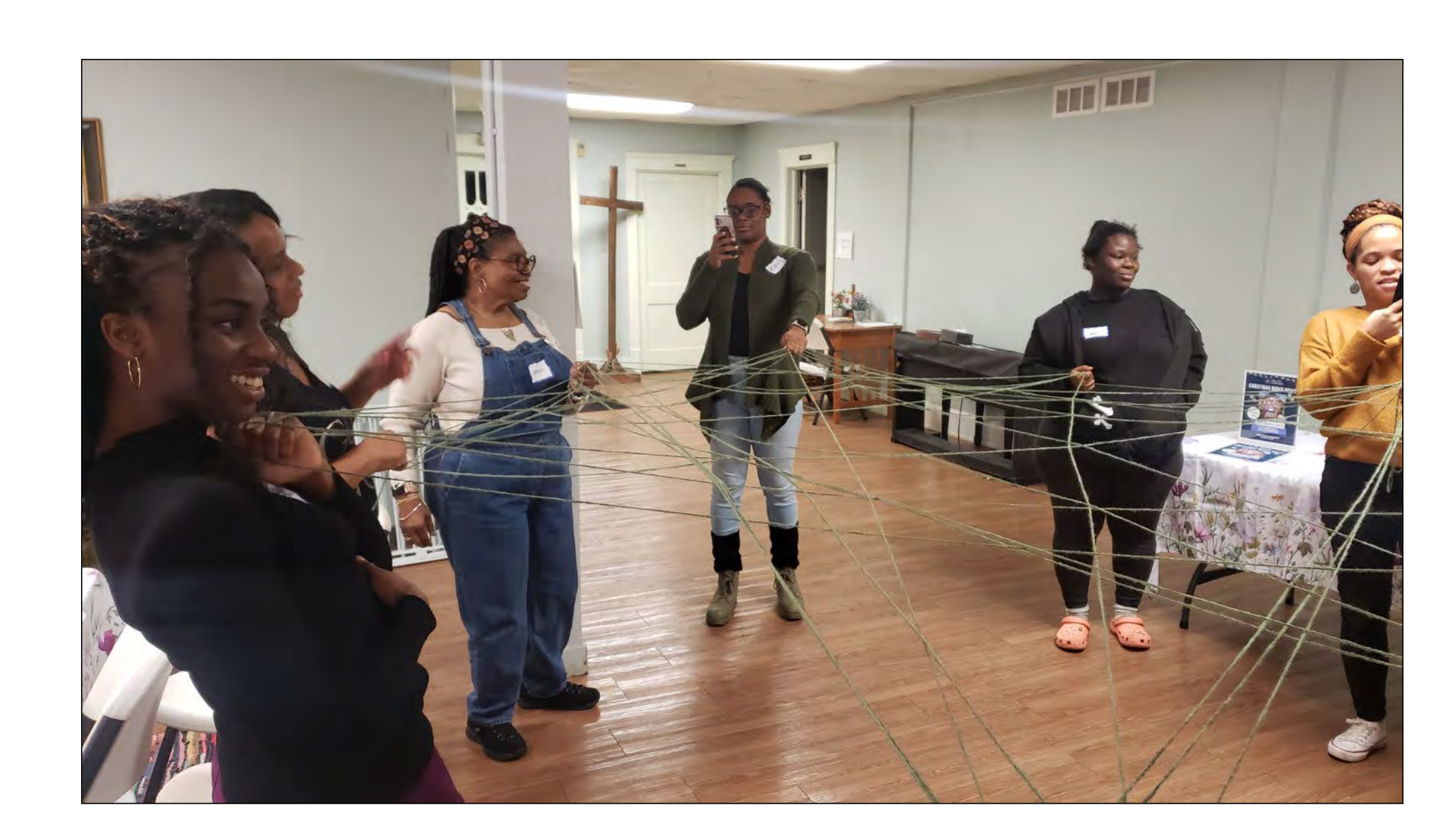
Figure 1— "Community" At this "community" themed moms' circle, each woman got the opportunity to hold a ball of yarn, share a statement about herself, and then pass the ball of yarn to anyone else in the circle who could relate. The end result? A web of connectedness