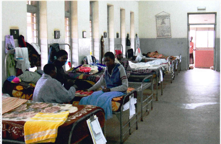
Patients in the tuberculosis (TB) ward at Mulago Hospital in Kampala, where the Uganda-CWRU Research Collaboration conducts clinical TB studies.

Uganda-CWRU Initiative Fighting Diseases and Building Capacity for 30 Years