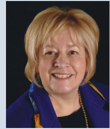
The Honorable Carol A. Roe, JD, MSN '79, RN Mayor of Cleveland Heights