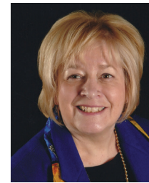
The Honorable Carol A. Roe, JD, MSN '79, RN Mayor of Cleveland Heights