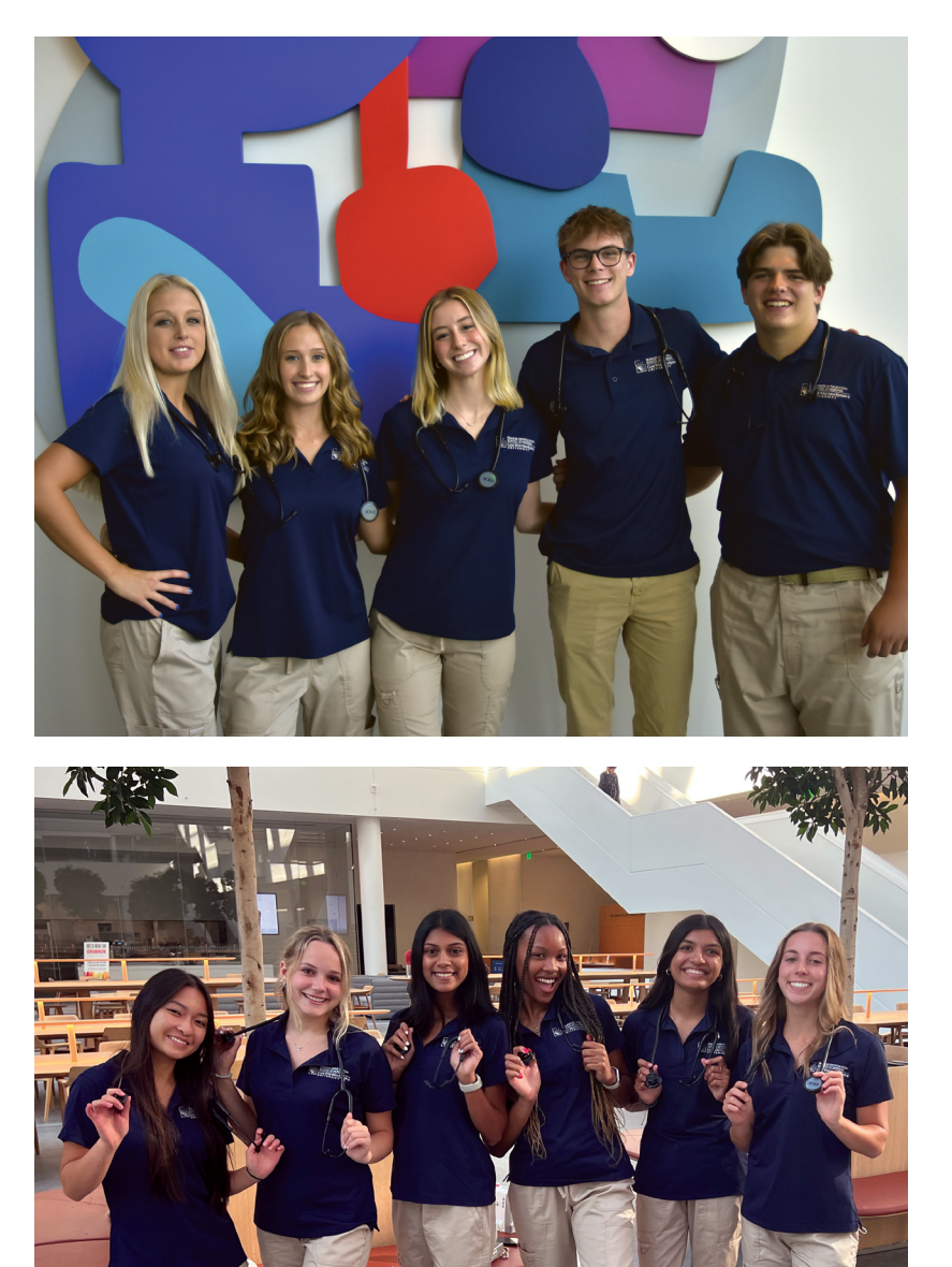
(Pictured) First-year Bachelor of Science in Nursing students celebrate at the Stethoscope Ceremony in September.