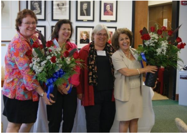
Business meeting and closing remarks