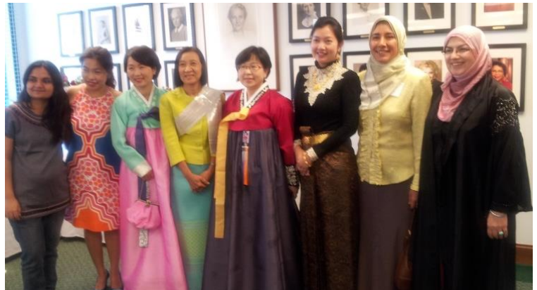
Attendees with their national traditional costumes