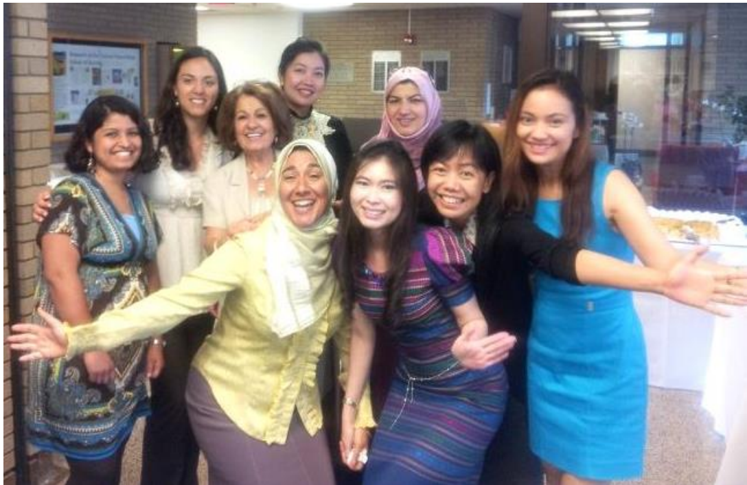
FPB student volunteers at the conference. Thanks to all FPB students who did a great job at the conference.