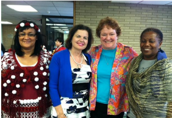
Colleagues from Suriname who joined the conference