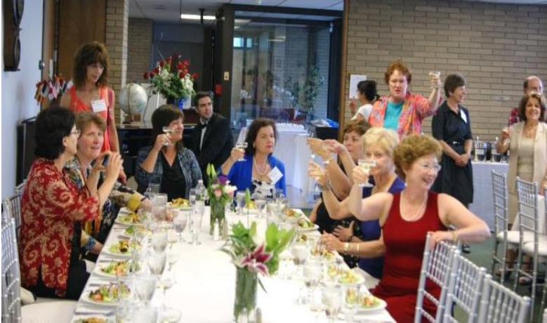
Gala dinner to celebrate the success of the inaugural home care conference.

Many positive responses were received from participants. Plans for the next conference are in process.