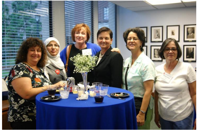
Wine and cheese welcome reception