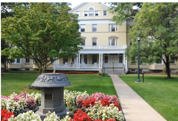
Guilford House Case Western Reserve University 11112 Bellflower Rd, Cleveland, OH 44106