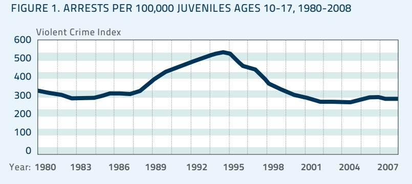
NATIONAL TREND DATA: JUVENILE ARREST RATES FOR VIOLENT CRIME INDEX OFFENSES

Research on youth violence has led to a greater understanding of the factors that can make children more susceptible to becoming victims or perpetrators