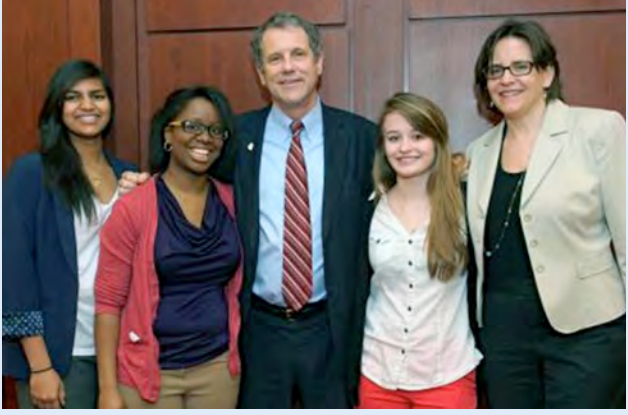
CLOCKWISE FROM TOP: CHILD POLICY STUDENTS CHRISTIE ELLIS, SRITA CHAKKA, AND BRITTANY RATTILIFF IN FRONT OF THE U.S. CAPITOL; SEN. SHERROD BROWN (CENTER) GREETS THE CLASS; STUDENTS MEET WITH FIRST FOCUS STAFF AND CEO, BRUCE LESLEY.