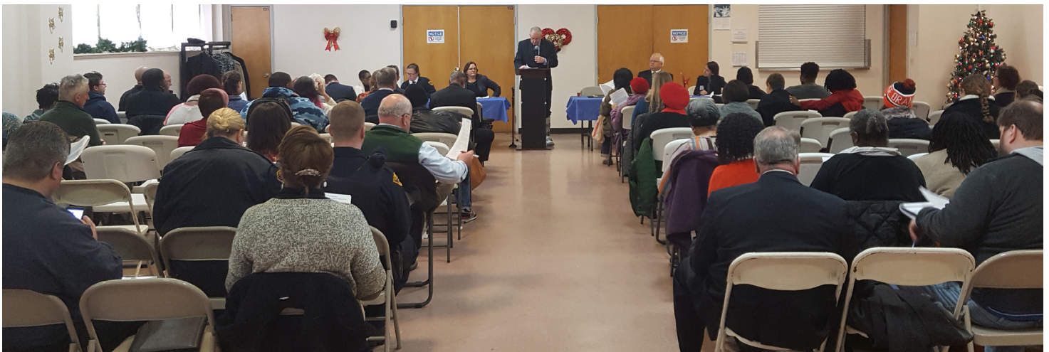
Members of the community review and offer suggestions on the draft CIT policies on December 13, 2017, at the Murtis Taylor Human Services System.

There were only minor changes over time regarding the source of the calls. This suggests that increased education of the public and outreach to families continues to be critical.