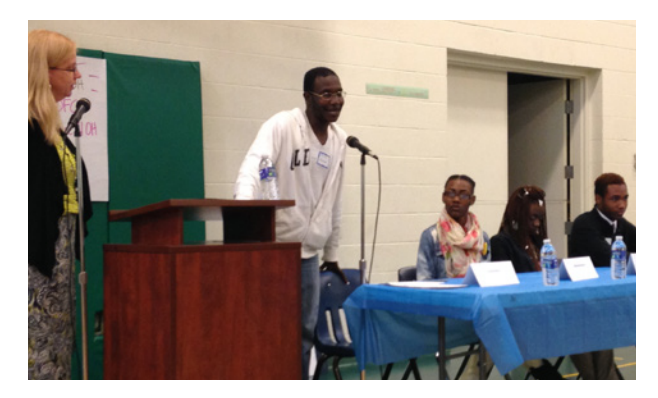
Youth panelists discuss their experiences leaving foster care.

The Ohio Fostering Connections Task Force was organized in 2014 by the Ohio Association of Child Caring Agencies to seek to extend supportive services for foster youth up to the age of 21. As