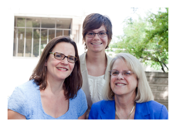
from the center