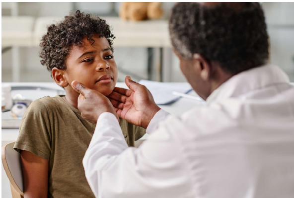
A doctor offering care and support can help to minimize trauma and ensure security.

Pediatricians, mental health providers, and other child-serving healthcare professionals across Ohio play a critical role in safeguarding the physical and emotional well-being of immigrant children. For many families, these providers are the first trusted point of contact when navigating healthcare systems while facing legal uncertainty, systemic barriers, and the fear of family separation. Compared to their U.S.-born peers, immigrant children are more likely to experience significant barriers to care, including higher uninsured rates and lower use of mental health services (Danaher, 2022). Despite the prevalence of traumatic events, immigrant families demonstrate strong levels of resilience; mental health supports should incorporate a strength-based approach with culturally responsive interventions that build upon the broader ecological contexts in which immigrant families live (Gillen, 2024).