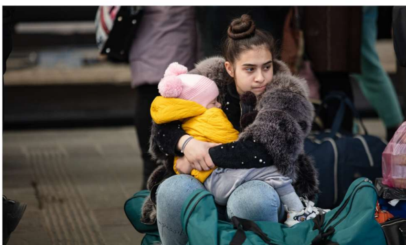
Families should find safety, support and culturally responsive care in a child-caring system committed to protecting their rights and well-being.

While the formal federal “sensitive locations” policy protecting hospitals and clinics from immigration enforcement was rescinded in 2025, enforcement in medical settings remains rare and discouraged, and providers should strive to preserve healthcare spaces as safe and private environments for all patients.