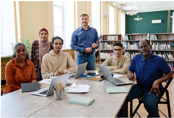
This guide offers many tips and resources for mixed-status households.

The RSC of Greater Cleveland maintains an interactive online directory of services for international newcomer families in Northeast Ohio. The directory connects immigrants, refugees, and asylees with a broad range of local supports, including ESL programs, healthcare providers such as Neighborhood Family Practice, school-based supports, legal aid, housing assistance, and community integration resources. Maintained by a coalition of Cleveland-area resettlement agencies, nonprofits, and educational partners, the RSC directory serves as a centralized tool for families and service providers to navigate available programs and build connections across the regional newcomer network.