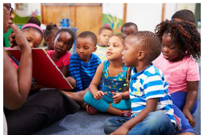
Every child, no matter their background, deserves a safe place to learn and belong.

Educators, school administrators, and other school-based professionals across Ohio are increasingly navigating the complexities of immigration-related concerns in their daily interactions with students and families. While immigration policies have shifted at the federal level, the foundational educational rights of children—regardless of immigration status—remain intact. The U.S. Supreme Court case Plyler v. Doe (1982) affirmed that all children, regardless of immigration status, have constitutionally protected access to free public K-12 education —a principle that remains binding law and continues to protect students today. These protections are not only legal obligations but ethical imperatives, especially in times of uncertainty and fear within immigrant communities. Some students also qualify for protections under the federal McKinney-Vento Homeless Assistance Act of 1987 (AFT, 2025). Under the Family Educational Rights and Privacy Act (FERPA), schools may not disclose personally identifiable information in education records without the written consent of the parent or student, except under certain conditions. These privacy protections also apply to undocumented students (USDOE, 2025).