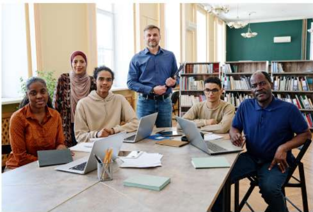
This guide offers many tips and resources for mixed-status households.

The RSC of Greater Cleveland maintains an interactive online directory of services for international newcomer families in Northeast Ohio. The directory connects immigrants, refugees, and asylees with a broad range of local supports, including ESL programs, healthcare providers such as Neighborhood Family Practice, school-based supports, legal aid, housing assistance, and community integration resources. Maintained by a coalition of Cleveland-area resettlement agencies, nonprofits, and educational partners, the RSC directory serves as a centralized tool for families and service providers to navigate available programs and build connections across the regional newcomer network.