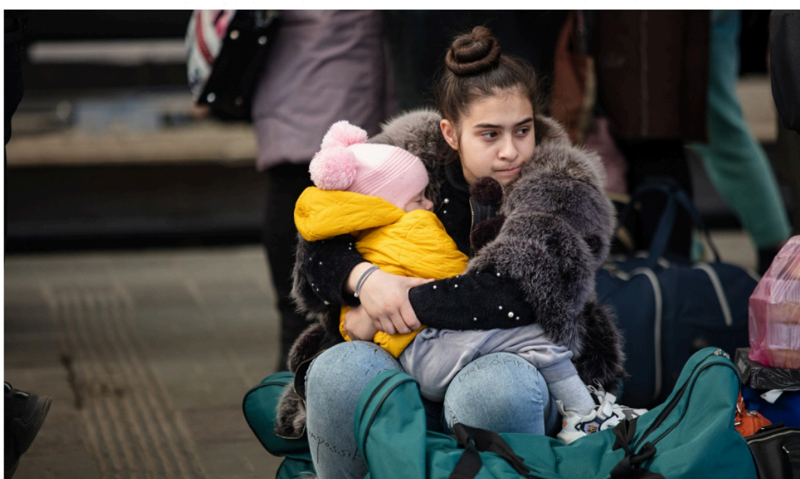
Families should find safety, support and culturally responsive care in a child-caring system committed to protecting their rights and well-being.

Neighborhood Family Practice (NFP) serves as the primary healthcare provider for Cleveland’s three refugee resettlement agencies. Newly arrived refugees receive comprehensive health screenings at NFP’s Ridge Community Health Center, including medical exams, lab work, vaccinations, and mental health assessments. In addition to refugee intake services, NFP offers behavioral health, case management, and wellness programs tailored to the needs of immigrant, refugee, and asylum-seeking families.