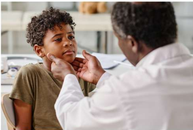
A doctor offering care and support can help to minimize trauma and ensure security.

Pediatricians, mental health providers, and other child-serving healthcare professionals across Ohio play a critical role in safeguarding the physical and emotional well-being of immigrant children. For many families, these providers are the first trusted point of contact when navigating healthcare systems while facing legal uncertainty, systemic barriers, and the fear of family separation. Compared to their U.S.-born peers, immigrant children are more likely to experience significant barriers to care, including higher uninsured rates and lower use of mental health services (Danaher, 2022). Despite the prevalence of traumatic events, immigrant families demonstrate strong levels of resilience; mental health supports should incorporate a strength-based approach with culturally responsive interventions that build upon the broader ecological contexts in which immigrant families live (Gillen, 2024).