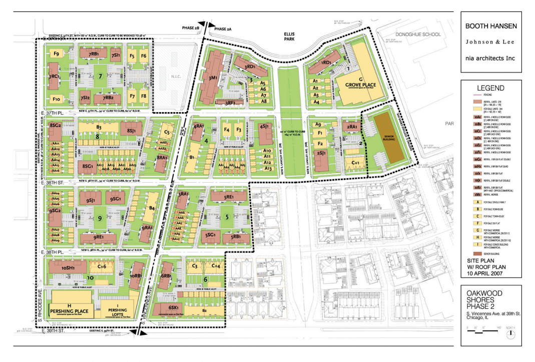
Figure 1. Oakwood Shores site plan.

Although these developments are described as 'mixed-income', much of our discussion here will broaden the consideration of mix to consider class and tenure as well, given that these are the distinctions most often used by respondents, who refer to issues of lifestyle, behaviour, culture and attachment to work, or