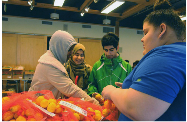
Harvest Share food distribution at New Columbia.