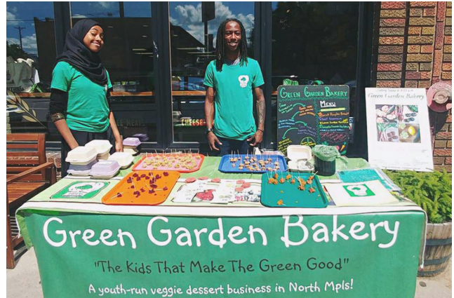
Green Garden Bakery youth selling veggie desserts