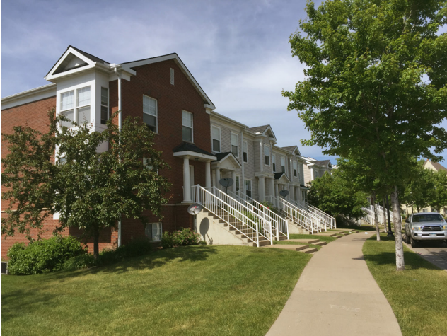
Homes at Heritage Park