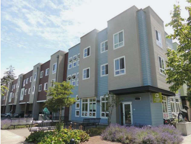
Apartment building at New Columbia