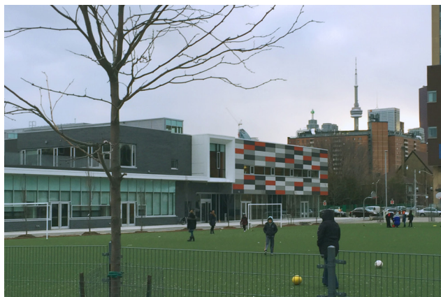
Athletic field designed with youth at Regent Park

Empowered youth engagement in the revitalization fundamentally impacted the revitalization for the better. The Forum helped build and establish a trust between youth and Toronto Community Housing staff that extended to parents and families. The Forum has also provided the civic space for engagement by neighborhood residents, including market-rate residents who are engaged in the revitalization, to build a community that is desirable for everyone and to address issues that are relevant for everyone, like community amenities and safety.