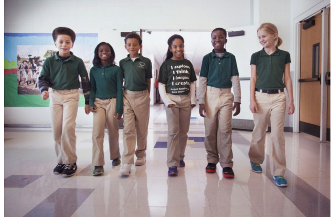
Students of Drew Charter School at Villages of East Lake.