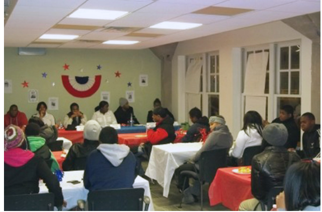
Youth Council meeting at Park Boulevard