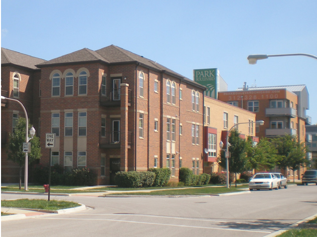
Apartment building at Park Boulevard