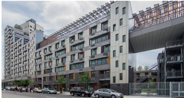
Fig. 3: VIA VERDE SUSTAINABLE MIXED-INCOME HOUSING IN NEW YORK CITY