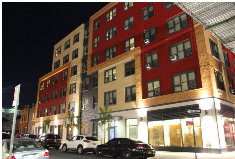
Fig. 4: LIVONIA COMMONS

One of the first ELLA projects to be developed, by Dunn Development and L&M Development Partners, is Livonia Commons. Located in the East New York section of Brooklyn, the development includes 278 apartment in four buildings. Fifty-one units consist of supportive housing for formerly homeless families who receive services on-site from two nonprofit organizations. More than half of the units are designated for families earning below 50 percent or 40 percent of AMI. The development also includes an arts center, a legal services office, a supermarket, a pharmacy, and other retail space. (see Figure 4).