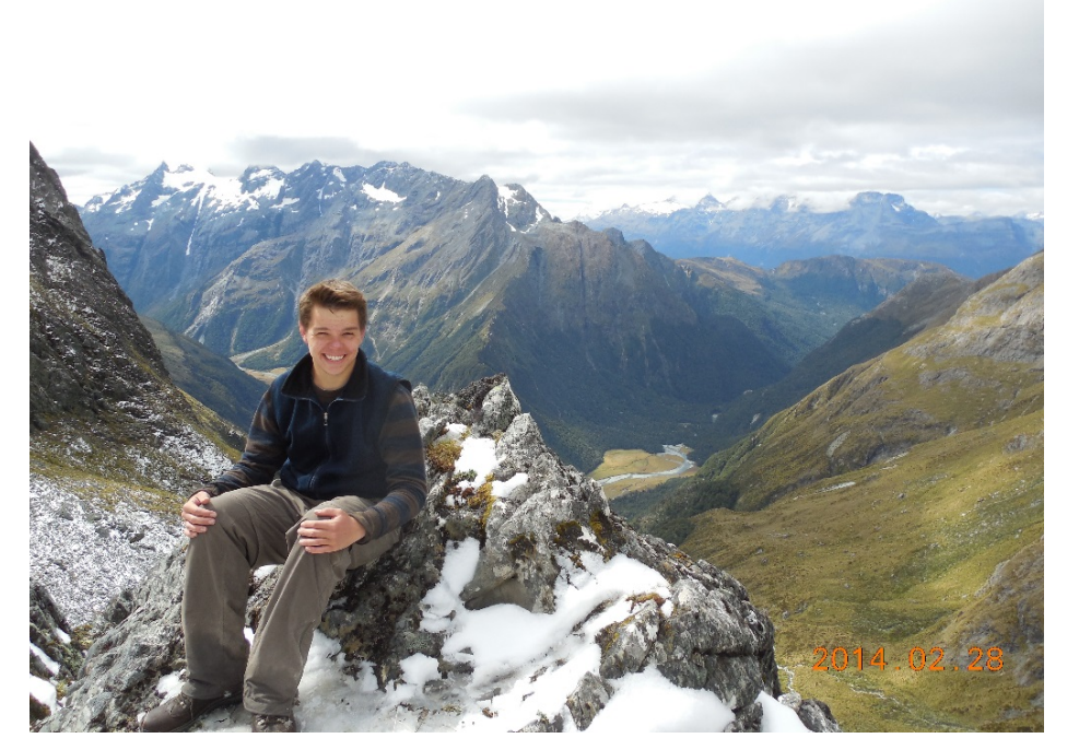
New Zealand: University of Otago

"Long Term": Study Abroad for one • to two semesters