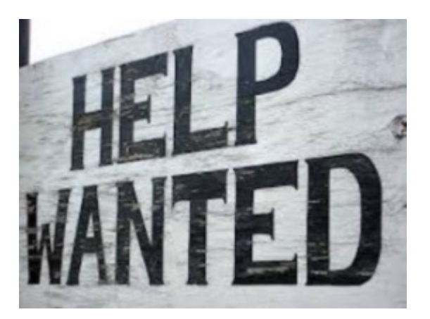
Seeking Green Student Workers!

Take our one question survey to help us decide which stainless steel drink container to give away to several hundred first year students this upcoming semester - a traditional metal water bottle or a insulated stainless steel cup with lid and straw that can be used at campus soda fountains? We are hoping to cut down on single use fountain drink cups but want to be sure they'd get used. Take the survey <u>here</u>. Thanks for your help!