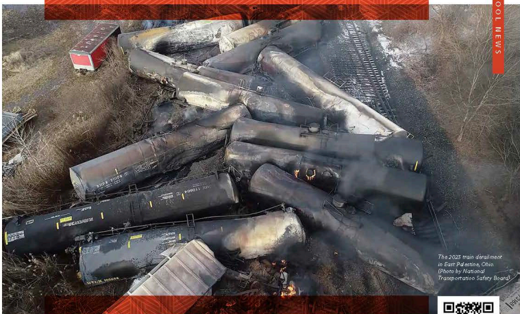
The 2023 train derailed in East Palestine, Ohio.