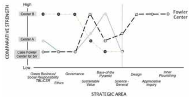
VALUE CURVE: FOWLER CENTER VS. OTHER CENTERS

The Fowler Center for Sustainable Value upholds Weatherhead’s commitment to Sustainable Enterprise as a core interdisciplinary initiative. Sustainable value is defined as a dynamic state that occurs when a company creates ongoing value for its shareholders and stakeholders. By “doing good” for society and the environment, the company does even better for its customers and shareholders than it otherwise would. The shift from shareholder value to sustainable value is the natural outcome of a new external environment characterized by declining natural resources, radical transparency, and rising expectations. Sustainable value is not just a better environmental strategy; it is a response to a radically different market reality in which the economic, ecological, and social spheres are unified into a single integrated value creation space. The Fowler Center leverages interdisciplinary scholarship and practice to help leaders capitalize on new profitable business opportunities to solve the world’s growing social and environmental problems. We work directly with all institutions to embed sustainability into their core strategy, applying cutting-edge competencies in design, innovation, whole systems, and Appreciative Inquiry.