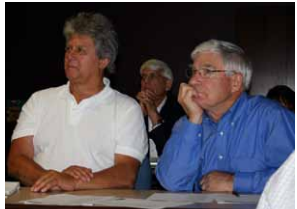
A Spring 2012 Sustainability Circle session addressing green financing and supply chain.

"The Circles linked my business to like-minded professional organizations in Northeast Ohio. Guest speakers shared fresh, implementable information. Their guidance, along with the camaraderie and support of fellow participants, helped turn the idea of becoming a sustainable company into a reality. It is a privilege to be a part of this group, and I'd recommend it to anyone looking for a new competitive edge."