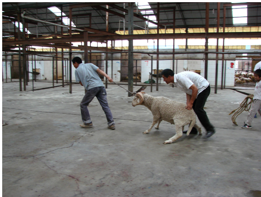
The end of the journey: slaughterhouse in Xining.

The preference for large herds of yaks needs reinvestigation in places like Domkhok, which no longer belong to the sphere of the subsistence economy. Large herds of yaks are not as crucial for the pastoralists' survival as they used to be. Yaks are not necessary to moving camps, since pastoralists now have cars. And who spins yak hair into tent cloth when black tents are now a rarity? Theoretically speaking, sheep, in the herders' own words, have some advantages which yaks lack. They grow faster and are more easily converted into cash. But now cash comes mainly from caterpillar fungus. Yet, it is not only economic reasoning which can make one